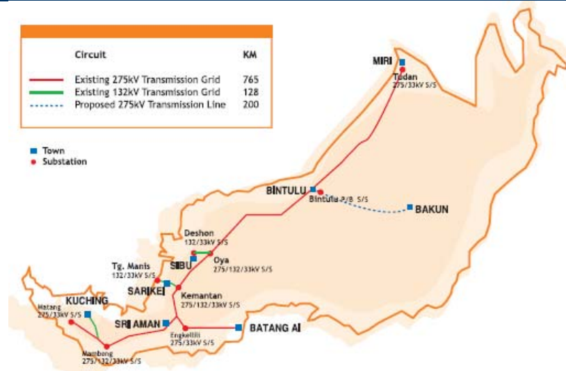
Figure 1: Main Grid System in Sarawak